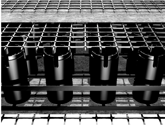
Geogrid layer #3 Geotextile (encases Rainstore3) Geogrid layer #2 Rainstore3 units Geotextile (encases Rainstore3) Geogrid layer #1