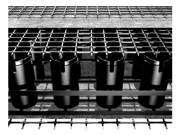
Geogrid layer #3 Geotextile (encases Rainstore3) Geogrid layer #2 Rainstore3 units Geotextile (encases Rainstore3) Geogrid layer #1